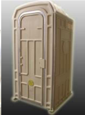
SJSPCS 600 Comfort Station