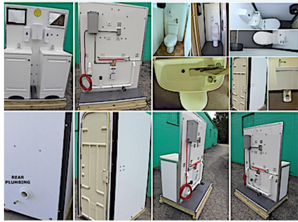
Model 3448 Lavatory Handwash Station