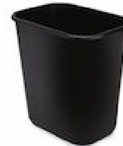
Fig. 18 Waste Basket

Each Model 3448 Includes all of the above and ships fully assembled with a starter supply of consumables.