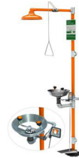
Fig. 11 Eye Wash Shower