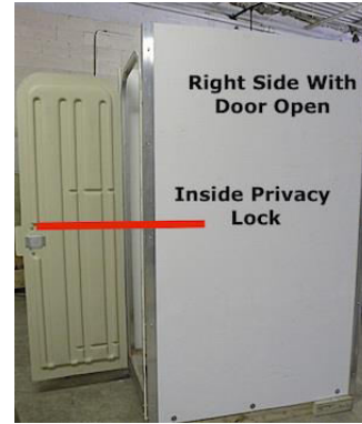
Fig. 3 Side View