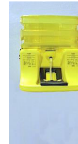
Fig. 10 Eye Wash Attachment