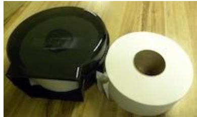
Fig. 15 - 9" Toilet Tissue Dispenser