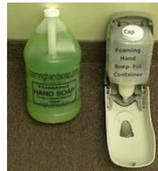
Fig. 17 Foaming Hand Soap Dispenser