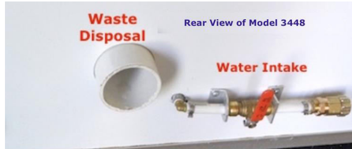
Fig. 13 Rear Plumbing