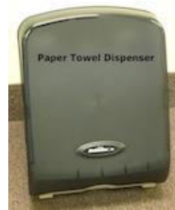
Fig. 16 Paper Towel Dispenser