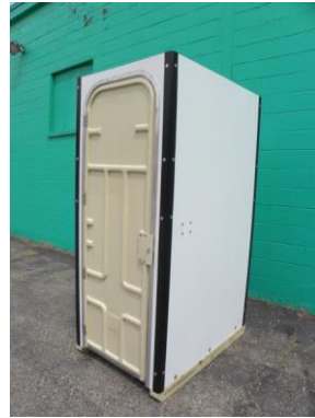
Fig. 2 Outside View