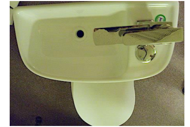
Fig. 5 Sink Top View

Model 3448 Dimensions of 34" x 48" x 96" .86m x 1.22m x 2.44m