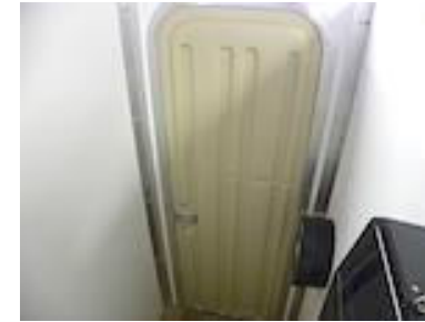
Fig. 4 Inside Door View