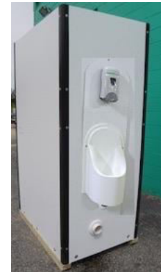
Fig. 8 Waterless Urinal Attachment