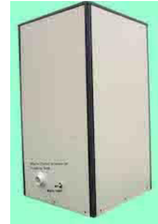
Fig. 14 Rear View Model 3448